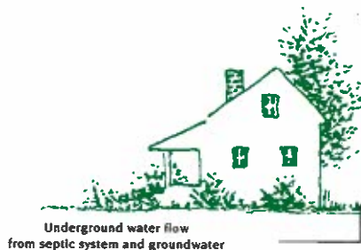
Underground water flow from septic system and groundwater